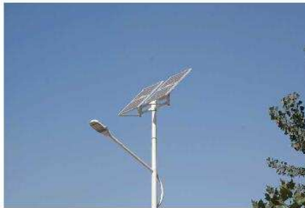
LED Street Light LU2 in China

LED technology is increasingly being used in street light applications due to its longer life and energy-saving qualities. Compared to an HPS street light, an LED street light will last up to 50,000 hours and significantly reduce light pollution. An LED Street Light will also be better equipped to withstand extreme hot and cold temperatures than an HPS Street Light, which makes it suited for outdoor use. Moreover, LED Street Light has a 100 to 1,000 times faster response, even no delay, which results in sharp, pure color. See where we installed our BBE LED Street Light, choose LED Street Light from our LED today and experience the future of light!