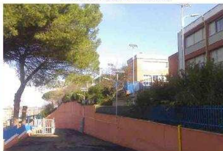
LED Street Light LU2 in Italy