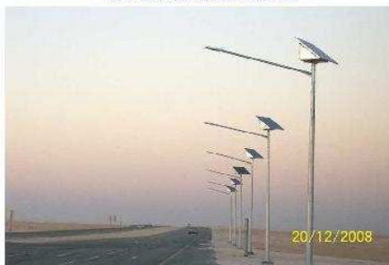
LED Street Light LU2 in Chile