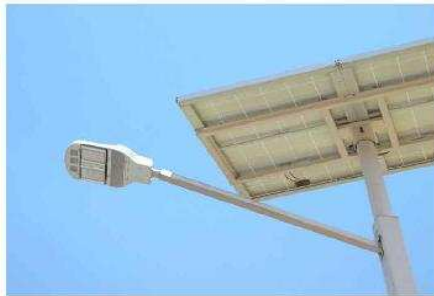
LED Street Light LU2 in Mexico