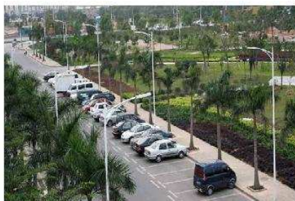
LED Street Light LU4 in China

LED technology is increasingly being used in street light applications due to its longer life and energy-saving qualities. Compared to an HPS street light, an LED street light will last up to 50,000 hours and significantly reduce light pollution. An LED Street Light will also be better equipped to withstand extreme hot and cold temperatures than an HPS Street Light, which makes it suited for outdoor use. Moreover, LED Street Light has a 100 to 1,000 times faster response, even no delay, which results in sharp, pure color. See where we installed our BBE LED Street Light, choose LED Street Light from our LED today and experience the future of light!