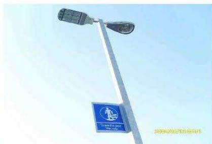
LED Street Light LU4 in Chile