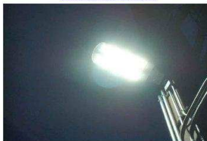
LED Street Light LU4 in USA