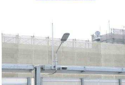
LED Street Light LU4 in Japan